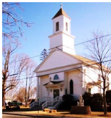
St. Mary Oratory 11 Lincoln St. Brookfield, MA 01506