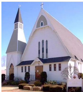
Sacred Heart of Jesus Church 22 West Main St. West Brookfield, MA 01585